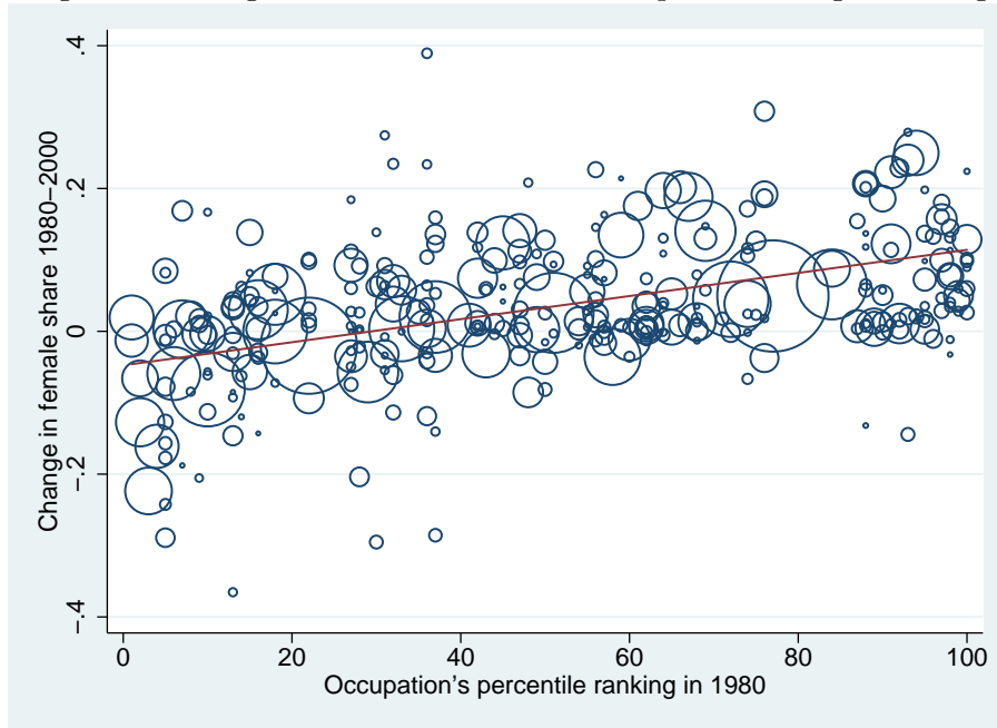
Figure 1: Change in Female Share and Occupational Wage Ranking

Notes: Each circle represents a 3-digit occupation (size indicating its share of total employment in 1980). Data on employment and wages from the 1980 and 2000 decennial censuses. See text for details.