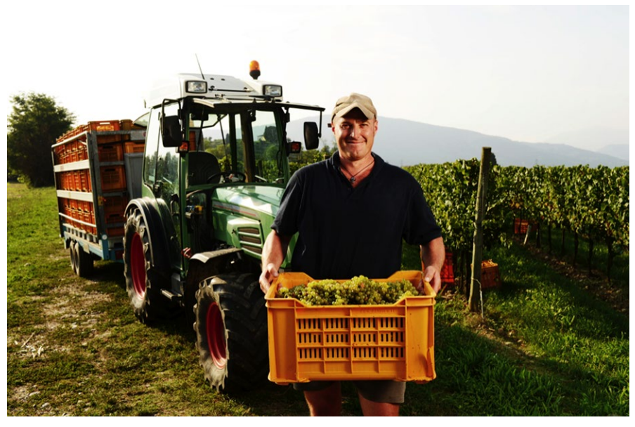
In Brazil both small and large farms may be important for producing an adequate supply of a wide range of food products for the domestic market.

cattle farms long before the expansion of large farms specialising in high tech grain production. In many parts of the world, in contrast, where small-sized farms dominate, property rights are not always clear and/or considerable common property may exist. In these set-